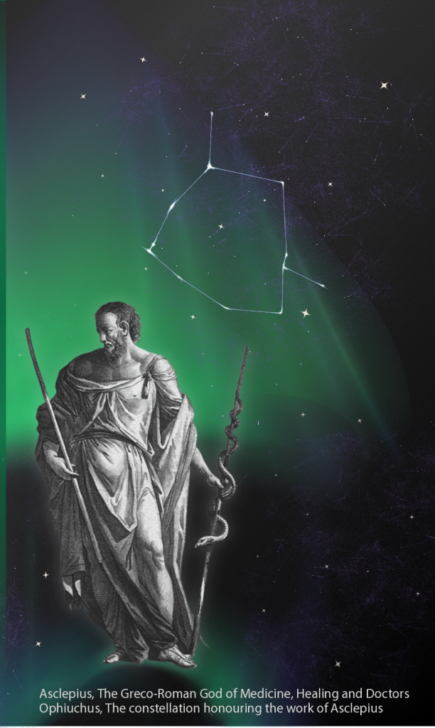
Asclepius, The Greco-Roman God of Medicine, Healing and Doctors Ophiuchus, The constellation honouring the work of Asclepius

This formal evening social event unites conference goers and reunion festivities of College of Medicine alumni, and provides a platform for all to connect around shared experiences and to recognize the achievements of those in our healthcare community.