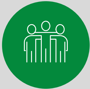
Success in Medical School III