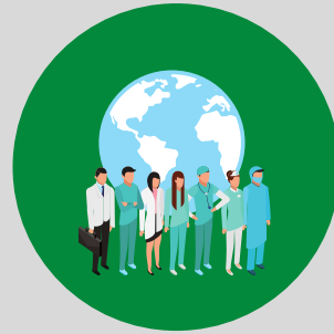
Clinical Rotations I