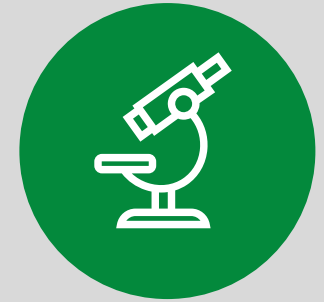
Selected Topics in Medicine