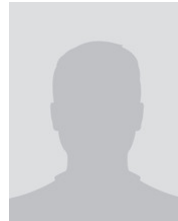
TBD Student Affairs & OCAM Associate