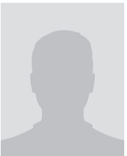
TBD Indigenous Coordinator