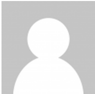
TBD Admissions Officer