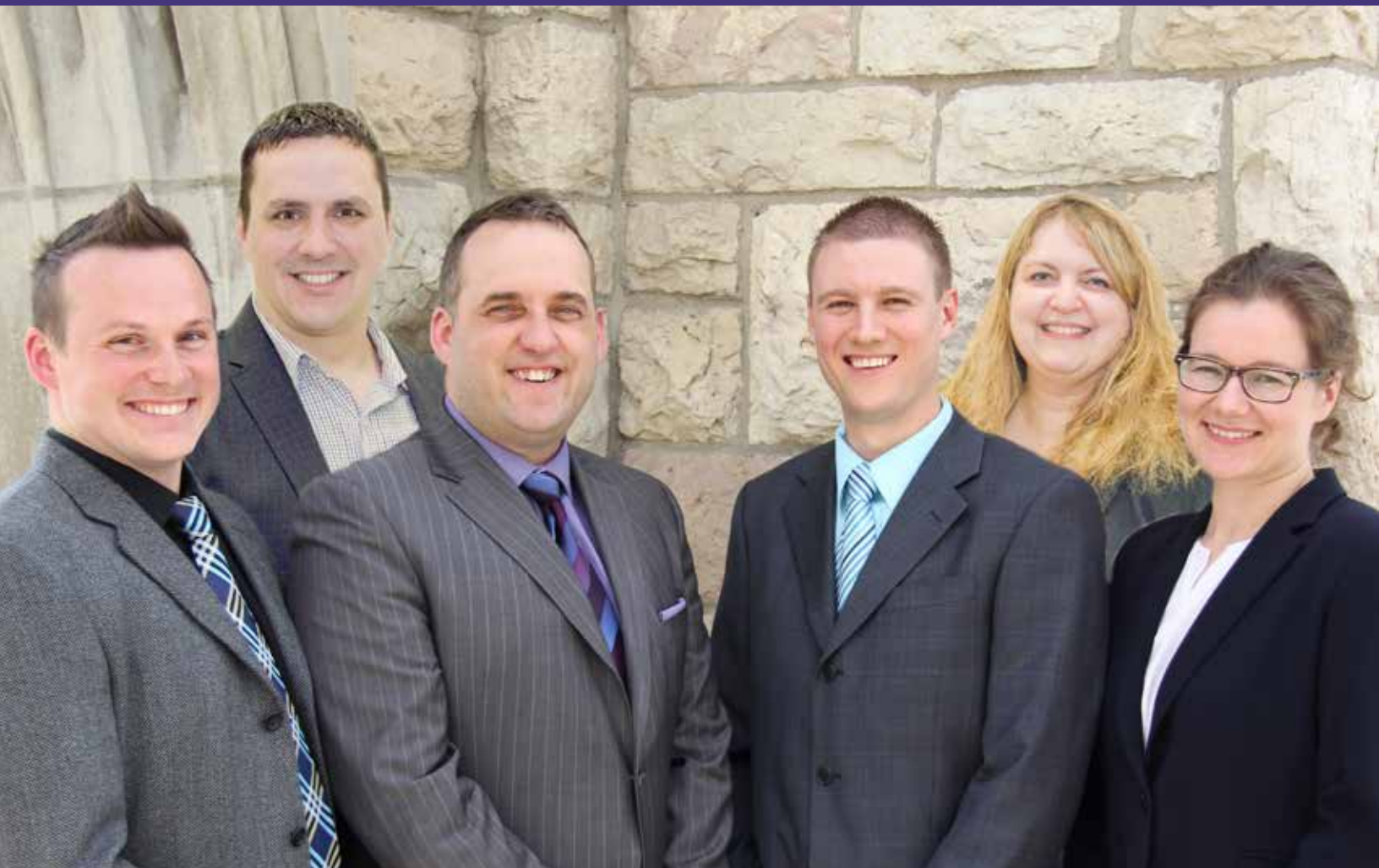
2014 Graduating Class