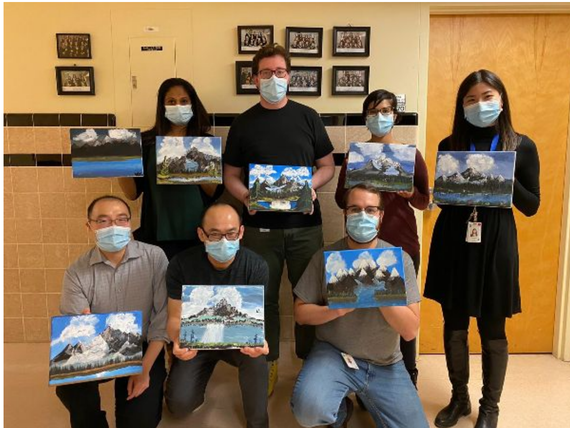
General Pathology Resident Wellness Event Funded by PGME RRO, Feb 2021.

Have you experienced/witnessed unacceptable behaviour or a harmful incident as a resident? Consider your Safe Reporting Options .