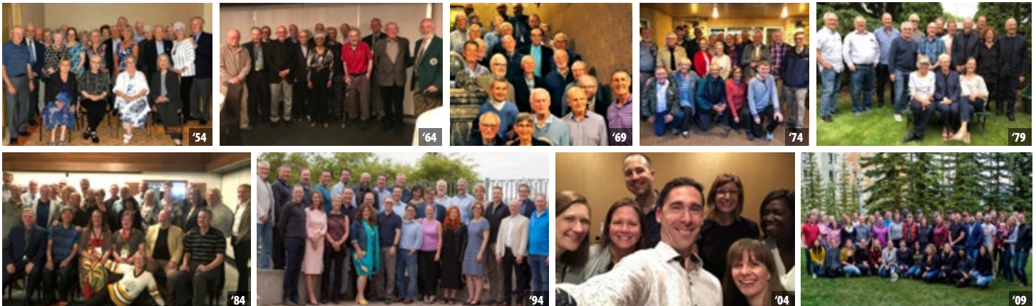
CLASS PARTY PHOTOS - '54, '64, '69, '74, '79, '84, '94, 2004 and 2009